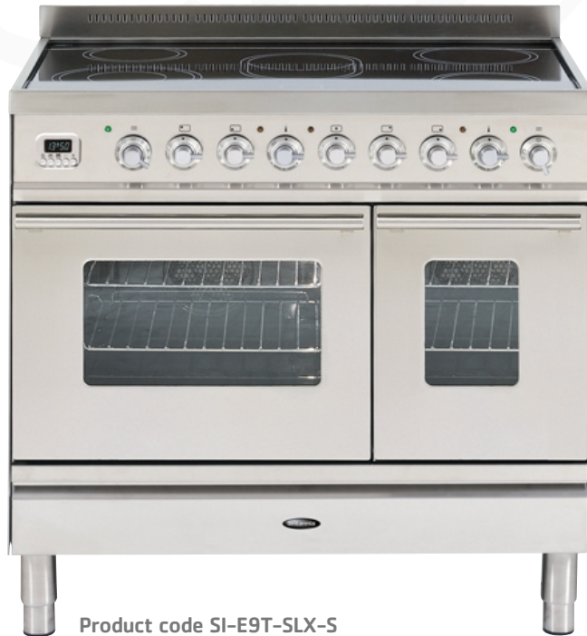
Product code SI-E9T-SLX-S

For further details please contact 0800 073 1003 www.britannialiving.co.uk