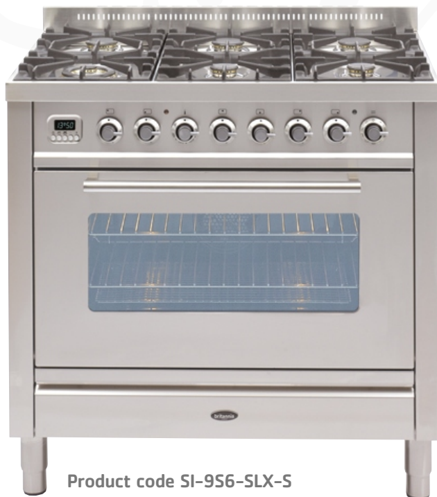
Product code SI-9S6-SLX-S

For further details please contact 0800 073 1003 www.britannialiveing.co.uk