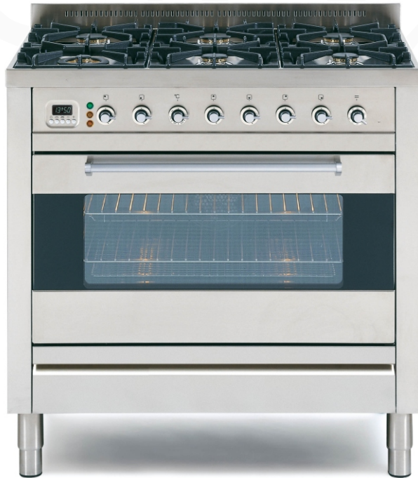
Product code SI-9S6-L-S

For further details please contact 0800 073 1003 www.britannialiving.co.uk