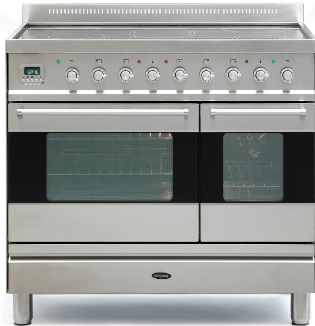
Product code SI-E9T-L-S

For further details please contact 0800 073 1003 www.britannialive.co.uk