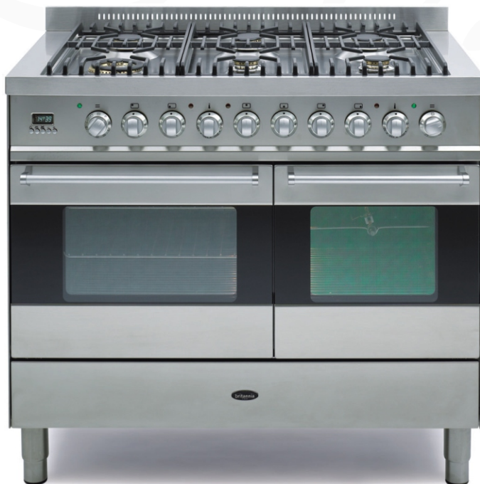
Product code SI-10T6-E-S