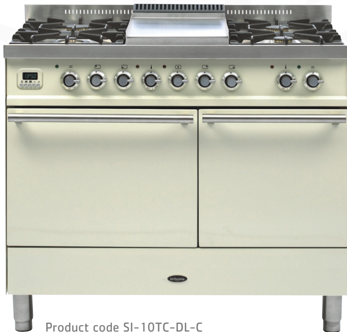
Product code SI-10TC-DL-C

For further details please contact 0800 073 1003 www.britanniainliving.co.uk