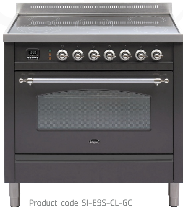
Product code SI-E9S-CL-GC

For further details please contact 0800 073 1003 www.britannialiving.co.uk